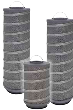
P579005, P579006, P579007

Fluid cleanliness is critical to protecting sensitive and expensive components. We've added new lube, fuel and hydraulic filters for some of the most common haul truck applications. They are manufactured, tested and proven to perform under the most severe conditions.