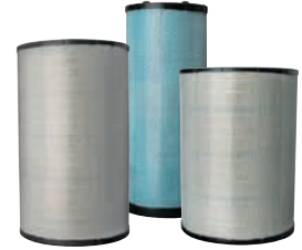
P609519, P609518, P608306

With so much riding on filtration, it's important to choose filters you can trust to perform. And, getting filters from one source is a big advantage too – simplifying orders, delivery and installation. Donaldson offers full filtration coverage for most major haul trucks. Air intake, fuel, lube, hydraulic – you can get it all – and you can trust it to perform.